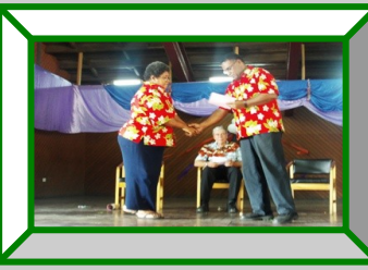
Di Tui of FVTTCDP receiving a certificate on behalf of FVTTCDP for participating in the IDPD celebration