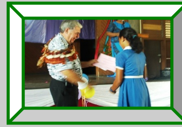
Oratory contest winner receiving her certificate during the IDPD Celebration