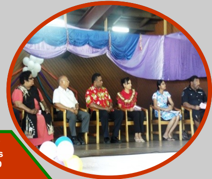
Right: Chief Guest & invited guest all seated during the celebration.