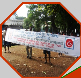
Left: Ready for the March pass