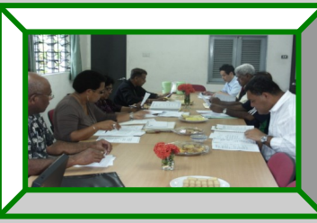
Participants sharing their information during the DISCOM meeting