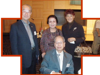
Top: wheelchair ready to be donated to FNCDP