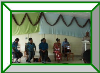
Supervisor Incharge of Suva Prison delivering his speech during the Yellow Ribbon Campaign