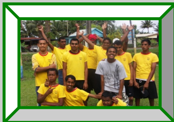
Students posing during the sports day in Nausori