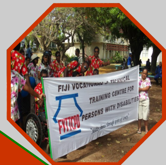
Right: FVTTCDP students enjoying the sun, ready for the march pass