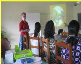
Roundtable consultation in Nausori and Suva