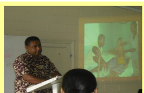
Disability Workshop page 4