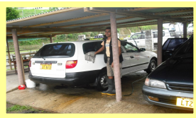
New car wash centre page 2