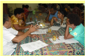
Roundtable consultation page 6