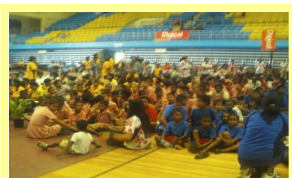
FPC 2010 Page 3