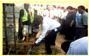
Northern disability centre page 2