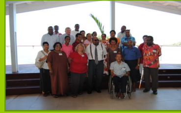
WORKSHOP ON DISABILITY TRAINING ON PERSONS WITH DISABILITIES Bula Vinaka to you all !!